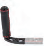
#HB70 Handle for Bracket Plates