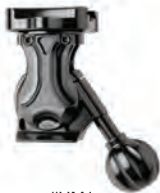
#HM1 Monopod Tilt Head