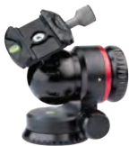
#BH1 Studio Ball Head