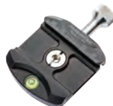
#C60 Arca Type Clamp