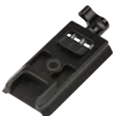
#PM501 Manfrotto Style Plate w/ Arca Clamp