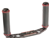
#VRH21 Dual Handle Video Rig w/ PBX3